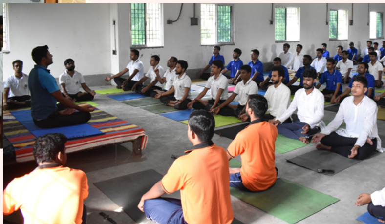
Common Yoga Protocol