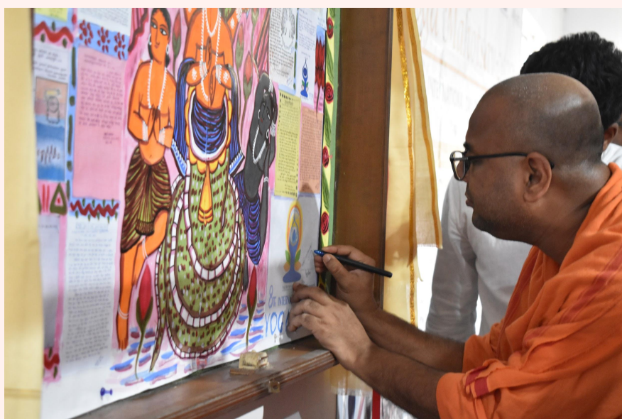
Inauguration of Yoga Wall Magazine

This one-year regular course is designed to prepare education professionals for yoga education within the primary, secondary, higher and tertiary education sectors. Our mission is to empower all communities with yoga to cultivate health and wellness in adults to aged people. Through evidence-based Professional Institutes, Professional Development, and Educational Resources, Yoga Ed. equips educators with yoga tools to integrate yoga for children to age people into academic environments. The course provides participants with an opportunity to develop themselves or atman which is essential in the education process and also to undertake a particular practical project related to their own work. A wide variety of methodologies – lectures, seminars and workshops are used throughout with a selection of key guest speakers from the local and national context brainstorming on relevant areas of Yoga Education, and other relevant themes. The course is designed particularly for Students of Postgraduate levels, Teachers, Instructors and Prospective Educational Leaders in the Indian Primary, Secondary and Higher Education sectors and other organizations working in this arena.