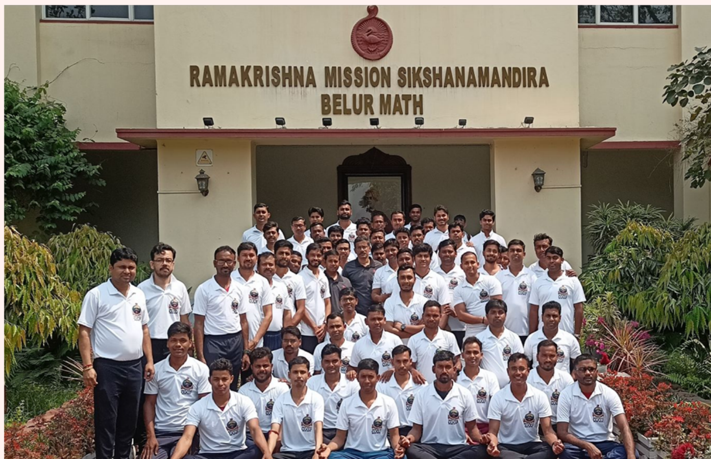
With the Mentor