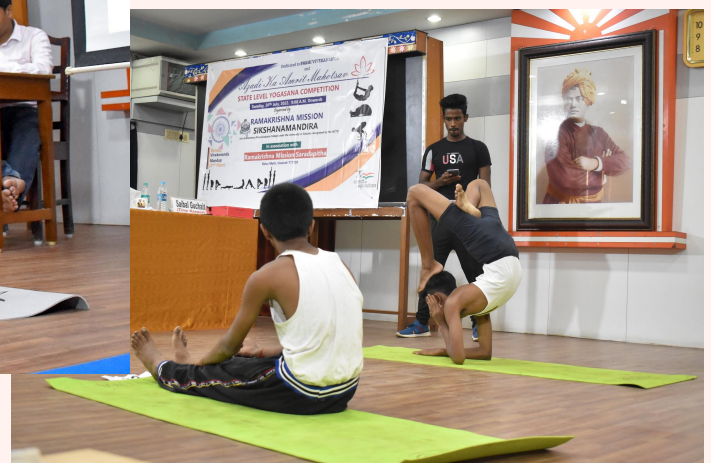
State Level Yoga Competition