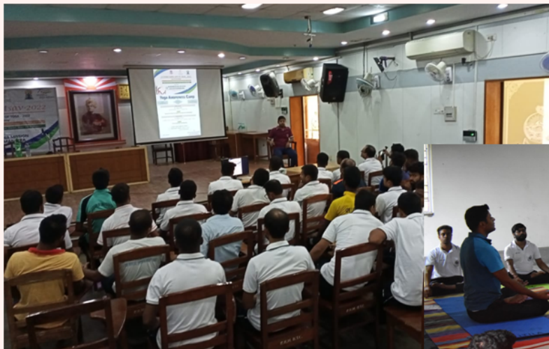
Yoga Awareness Camp