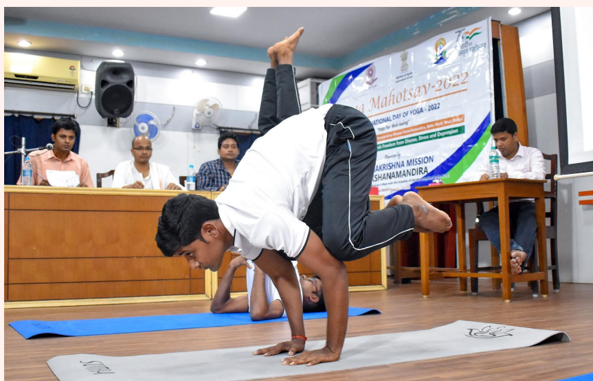
Internal Yoga Competition