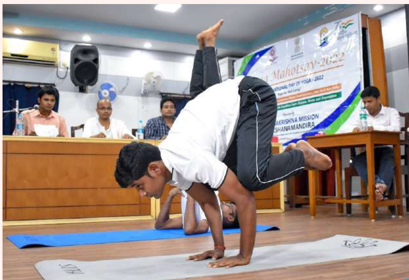
Internal Yoga Competition