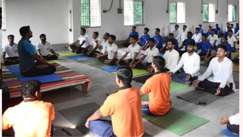
Common Yoga Protocol