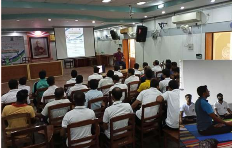
Yoga Awareness Camp