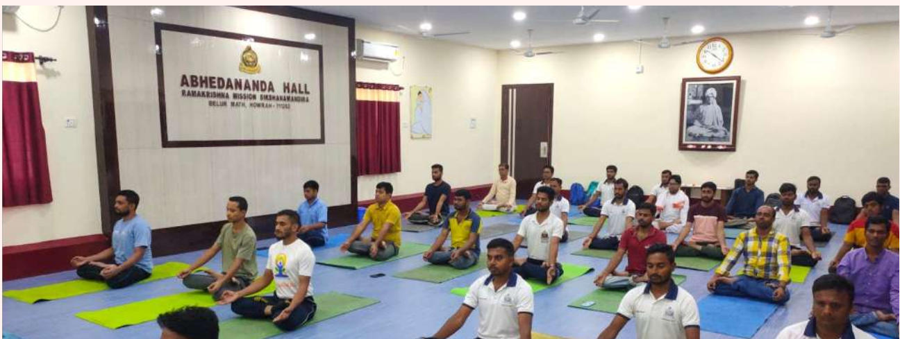
Yoga Practice in New Abhedananda (Yoga) Hall

N.B - 75% attendance in the classes is mandatory