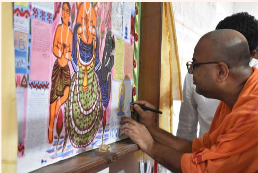
Inauguration of Yoga Wall Magazine

This one-year regular course is designed to prepare education professionals for yoga education within the primary, secondary, higher and tertiary education sectors. Our mission is to empower all communities with yoga to cultivate health and wellness in adults to aged people. Through evidence-based Professional Institutes, Professional Development, and Educational Resources, Yoga Ed. equips educators with yoga tools to integrate yoga for children to age people into academic environments. The course provides participants with an opportunity to develop themselves or atman which is essential in the education process and also to undertake a particular practical project related to their own work. A wide variety of methodologies – lectures, seminars and workshops are used throughout with a selection of key guest speakers from the local and national context brainstorming on relevant areas of Yoga Education, and other relevant themes. The course is designed particularly for Students of Postgraduate levels, Teachers, Instructors and Prospective Educational Leaders in the Indian Primary, Secondary and Higher Education sectors and other organizations working in this arena.