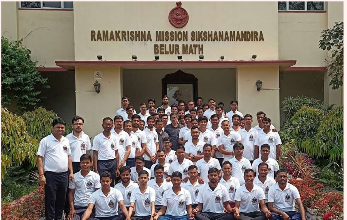
Yoga Students (Batch: 2022-23) in front of the College Building