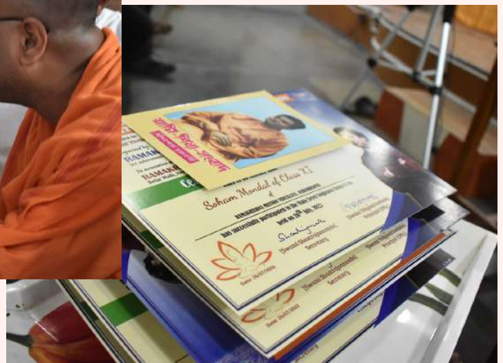
State level Yoga Competition