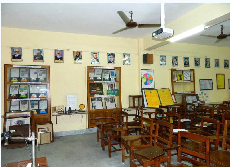
Psychology Resource Room

The course is designed particularly for Students of the Postgraduate Level, Teachers, Head teachers, Principals and Prospective Educational Leaders in the Indian Primary, Secondary and Higher Education sectors and other organisations working in this arena.