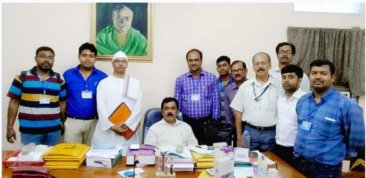
Field Visit for Practicum

N.B - 75% attendance in the classes is mandatory