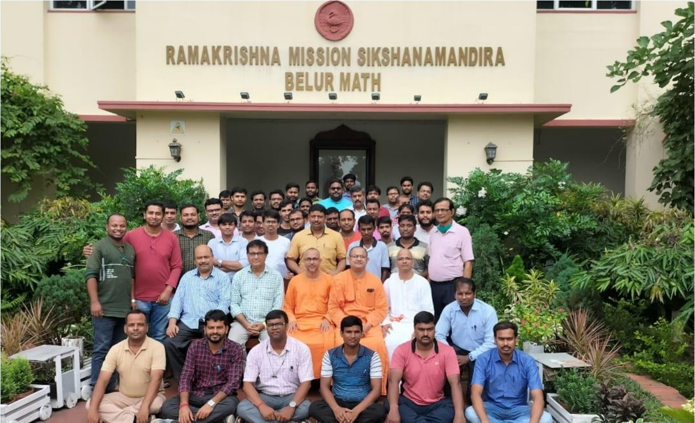
With the Mentors