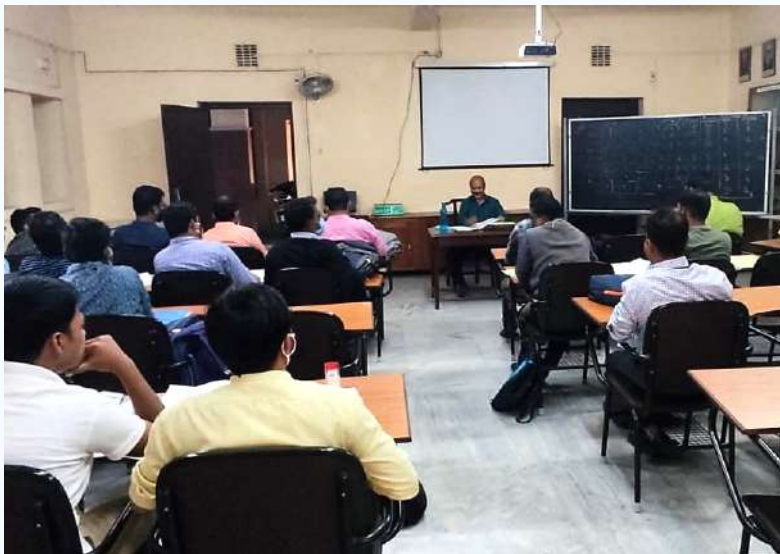
Offline Classes conducted in the Sikshanamandira classroom