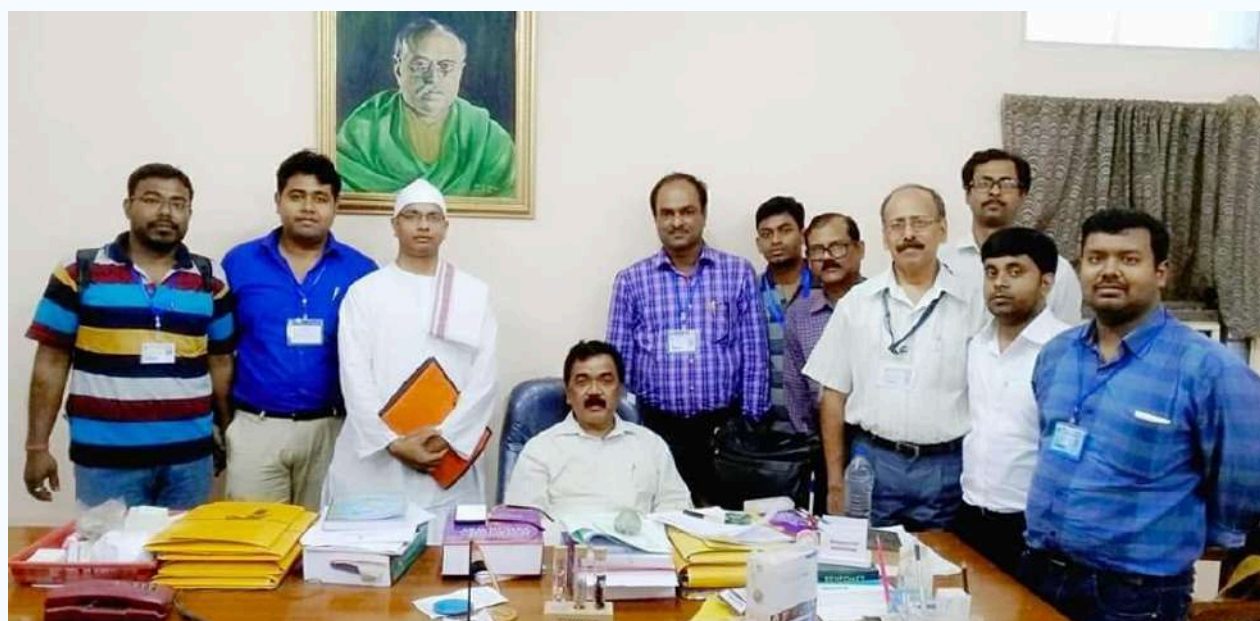
Field Visit for Practicum

N.B - 75% attendance in the classes is mandatory