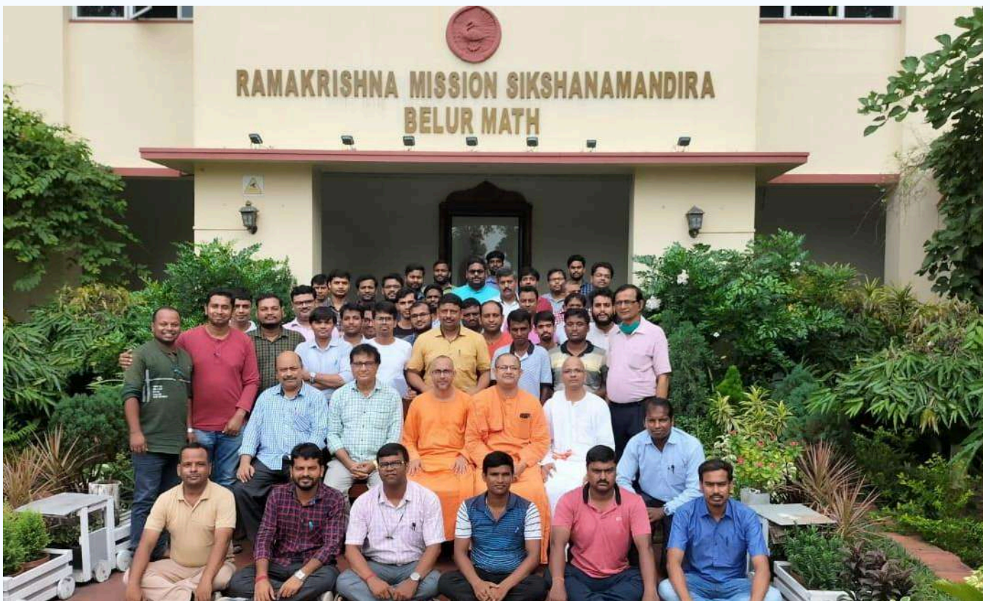
Guidance & Counselling Students (Batch: 2022-23) in front of the College Building