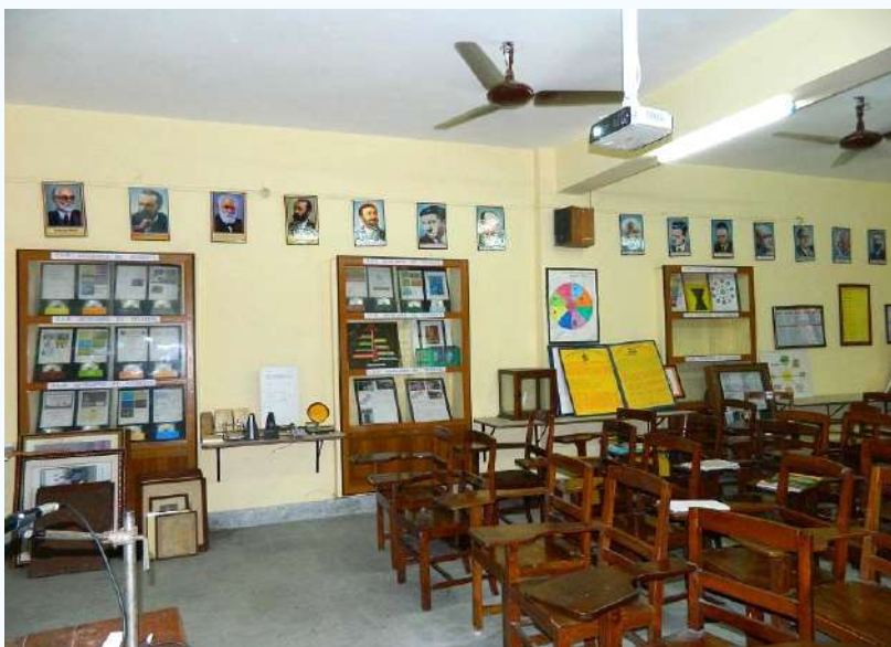
Psychology Resource Room

The course is designed particularly for Students of the Postgraduate Level, Teachers, Head teachers, Principals and Prospective Educational Leaders in the Indian Primary, Secondary and Higher Education sectors and other organisations working in this arena.