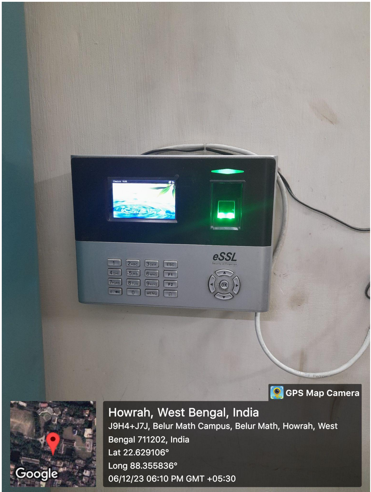
Biometric attendance system for students and staff