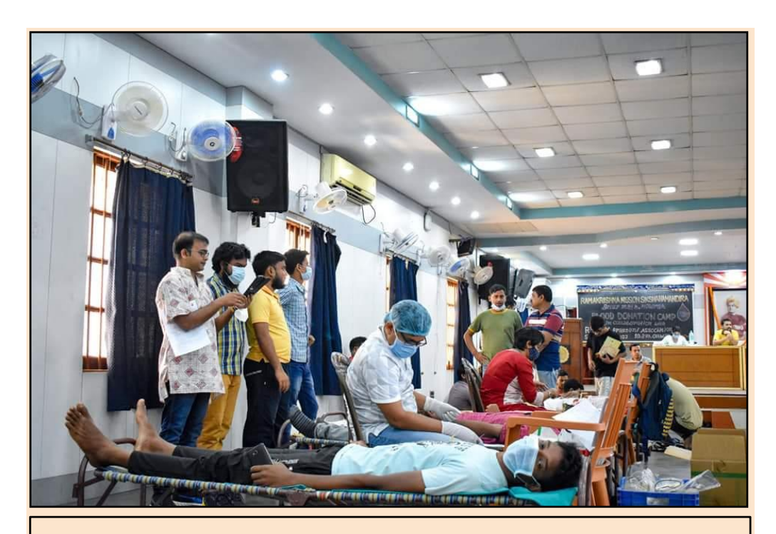
Blood Donation at Sikshanamandira Campus

Every year our Praktani Association of RKM Sikshanamandira, Belur Math organises a blood donation camp in collaboration with West Bengal Blood Donors Association, Kolkata. This kind of voluntary initiative helps to build awareness, perceptions, motivations and importance of blood donation among the students. They also come to know about the Blood transfusion which is an essential medical procedure conducted with various purposes to provide patients with blood needed. The procedure saves patients' lives, as blood cannot be manufactured artificially and can only be obtained from human blood sources.