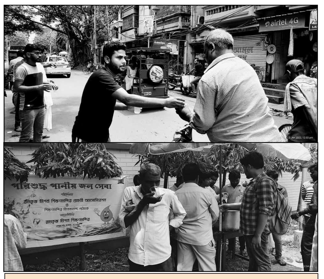
Our trainee-teacher during the Jalseva programme

Every year our Praktani Association organises a water distribution programme in front of the main gate of Belur Math where wayfarers were offered purified flavoured drinking water to quench their thirst in scorching summer heat. The students come to know the importance of Safe drinking water and sustainable sanitation are not privileges but fundamental rights. These initiatives ensure to our trainee teacher that every child who goes to a school where they have access to safe drinking water and good hygiene facilities.