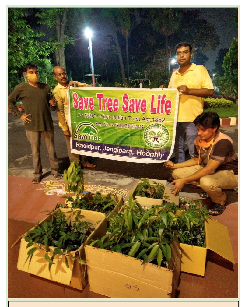
Saplings were distributed to 'Save Tree Save Life' NGO