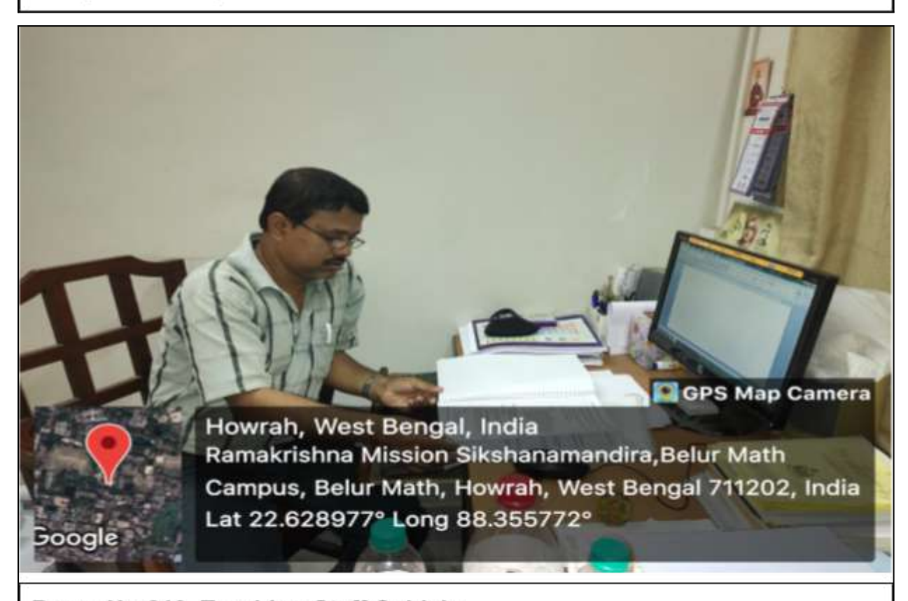
Room No-213, Teaching-Staff Cubicle