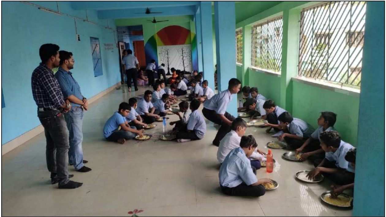
Trainees are instructed by the Principal/HM to supervise the Mid-day Meal distribution in Schools

Belur Math, Howrah - 711 202, West Bengal