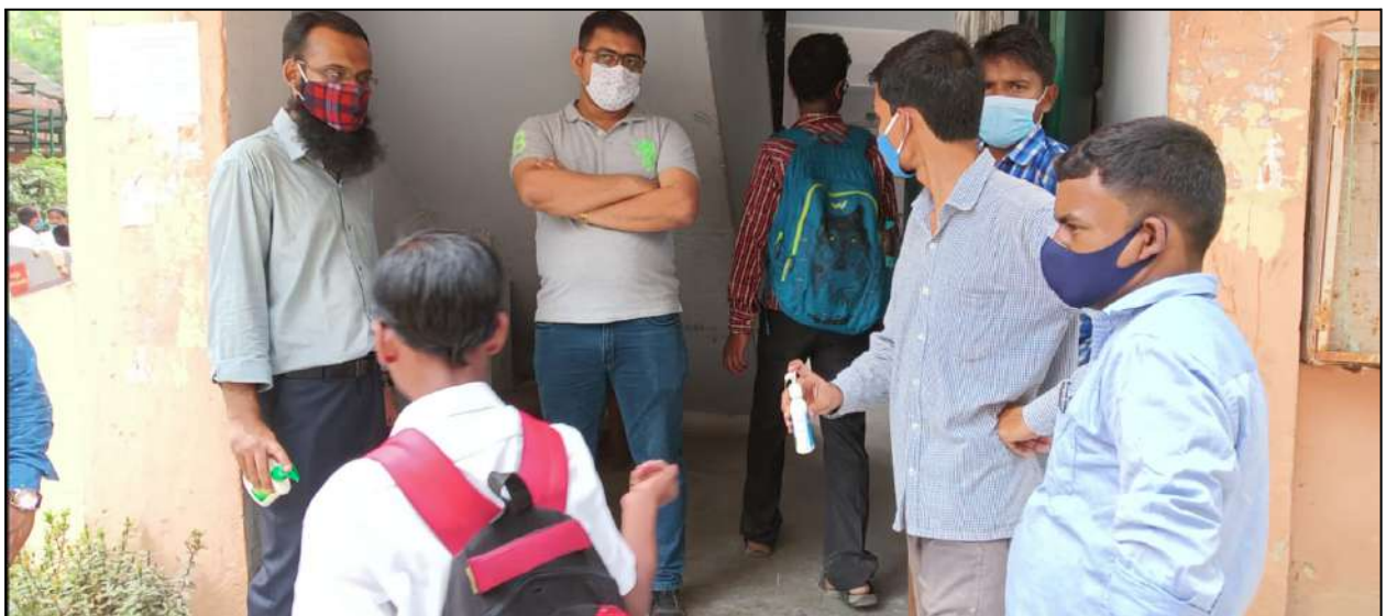
Trainees are instructed by the Principal/HM to maintain Proper sanitation in Schools

At the end of the internship programme the school Principal/HM gives his/her comprehensive internship appraisals of each internee assigned to his/her school which reflects the overall performance of the individual internees during the internship period.