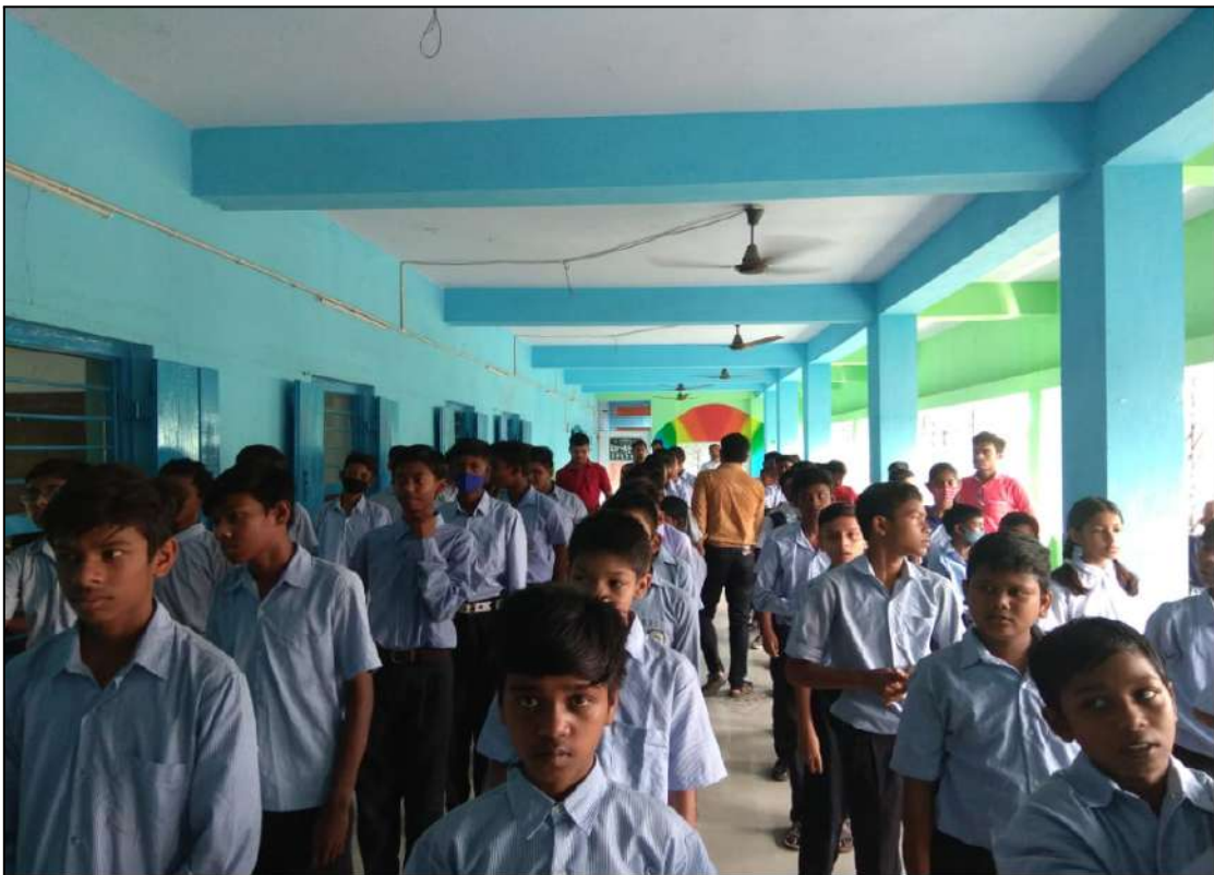
Trainees are instructed by the Principal/HM to conduct Morning Assembly in Schools

“Education is the manifestation of the perfection already in man.”