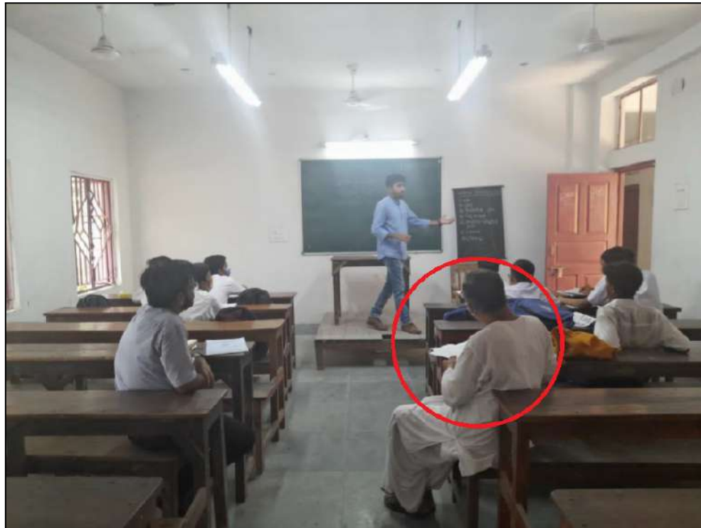
Observation of Teacher Educators during School Internship

Belur Math, Howrah - 711 202, West Bengal