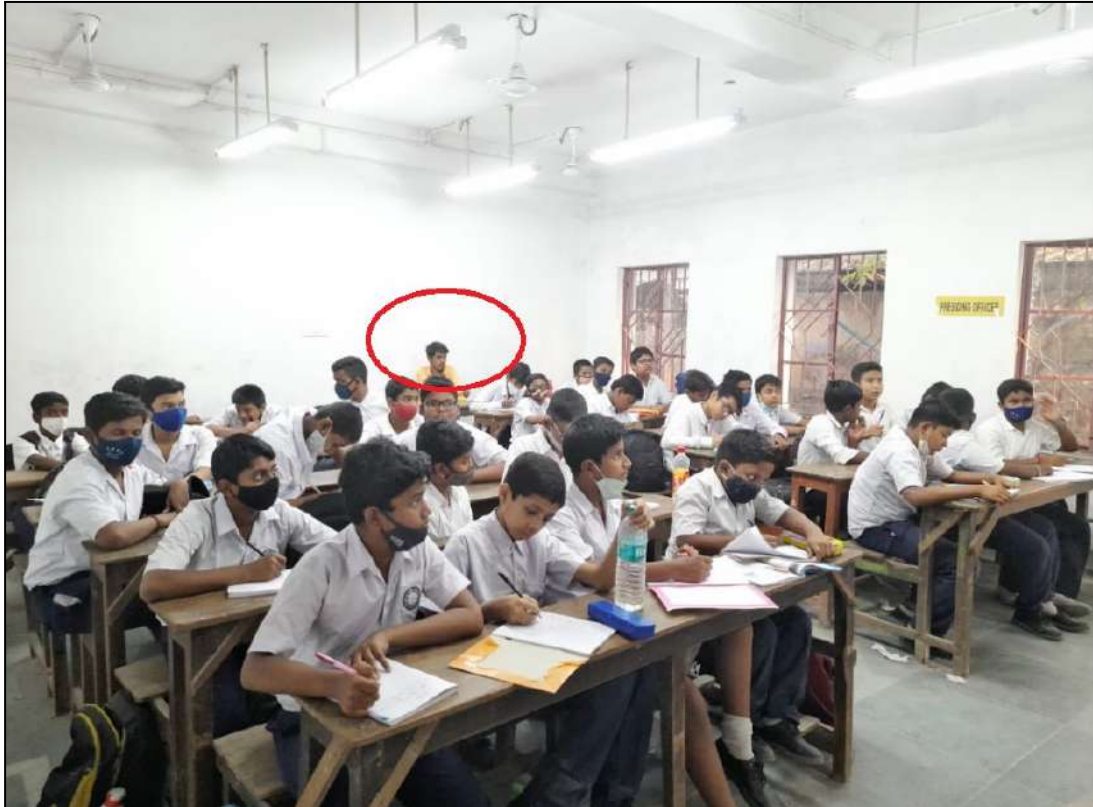
Observation of Peers