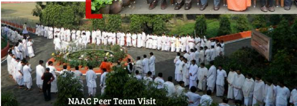
NAAC Peer Team Visit