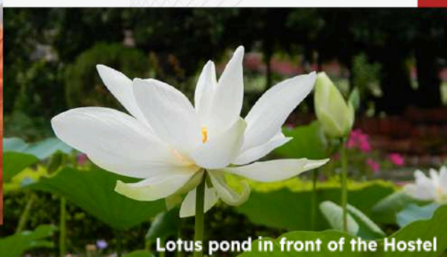
Lotus pond in front of the Hostel