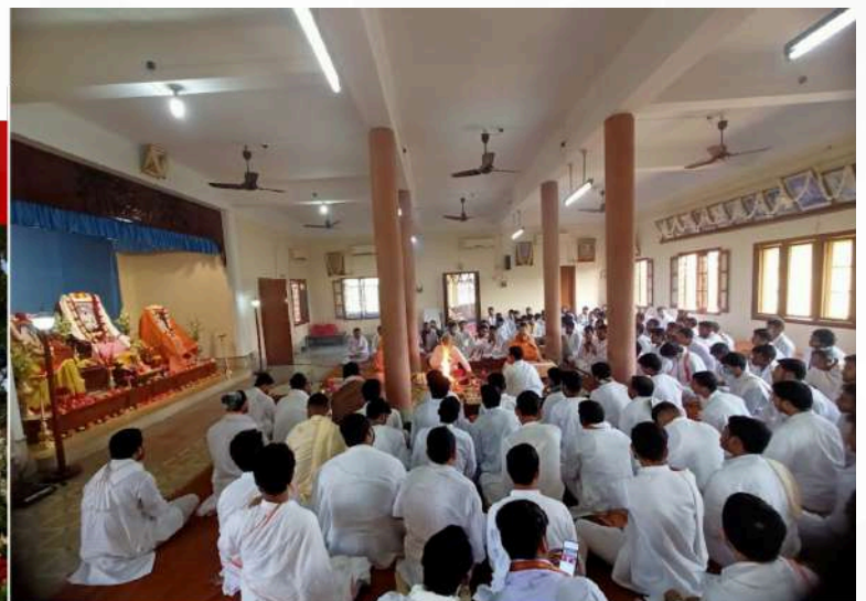
Hostel Prayer Hall