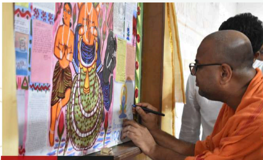
Inauguration of Wall Magazine