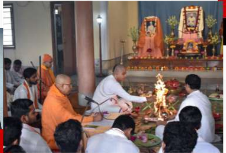
Vidyarthi Brata Homa