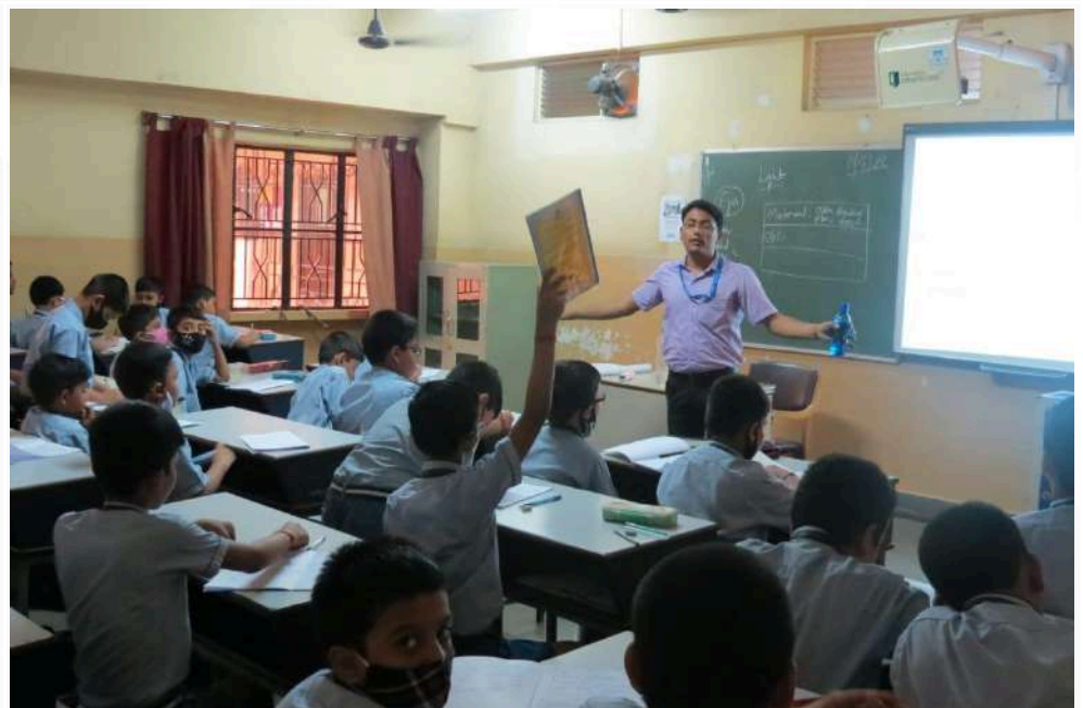
School Internship Programme