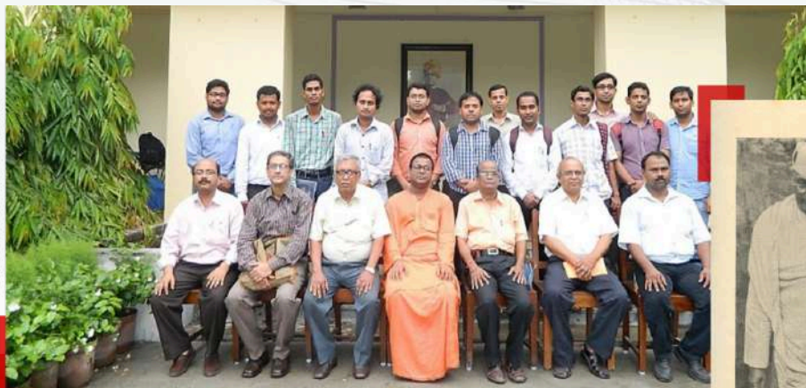
First M.Phil Batch