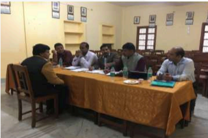
Campus Placement Drive