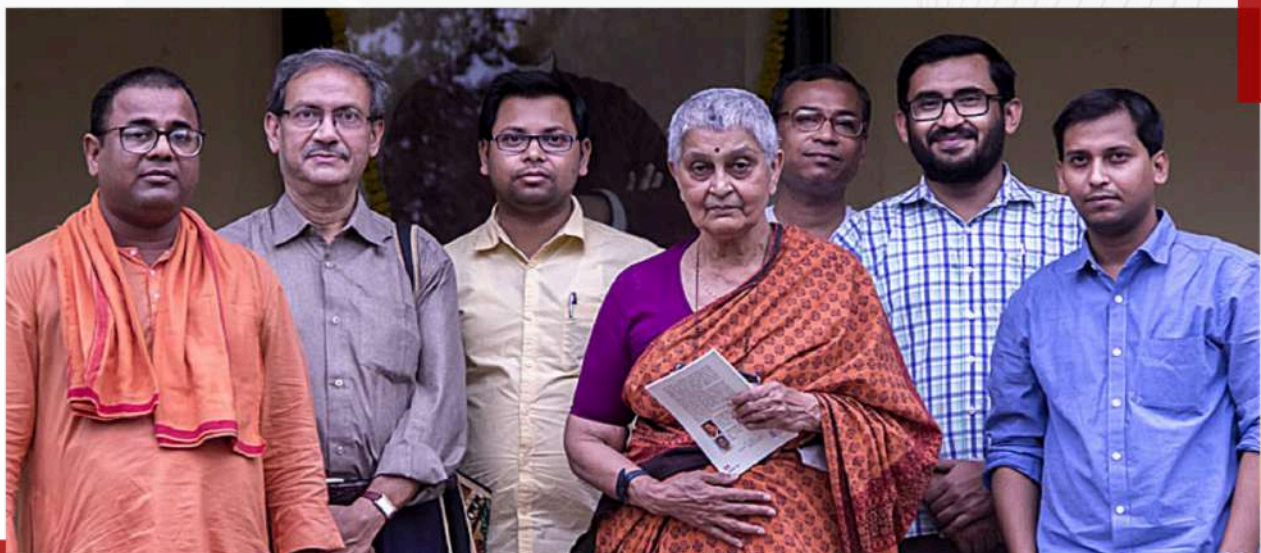
Gayatri Chakravorty Spivak with the Faculties

Sikshanamandira boasts a rich pool of eminent faculties of every discipline. Our faculties play an active role in conducting multifaceted researches in the field of Educational Studies both independently and under the umbrella of SWAMI VIVEKANANDA CENTRE FOR MULTIDISCIPLINARY RESEARCH IN EDUCATIONAL STUDIES - the apex research wing of Sikshanamandira. The availability of such collective teaching and research experience, makes sure that the transfer of knowledge to the students becomes fruitful and ineffaceble.