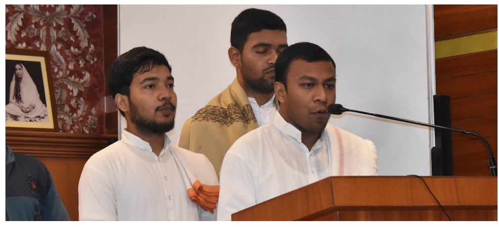
Vedic Chanting by the Students