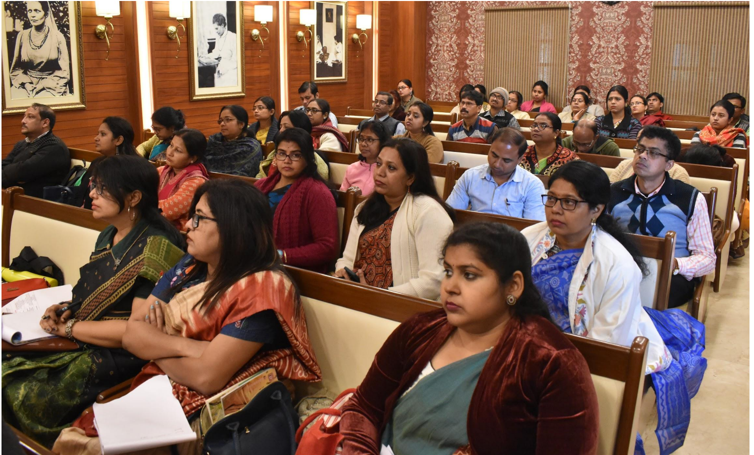
Trainees of the ISTTP on Geography