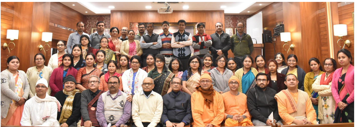
Group Photo of the Participants of ISTTP on Geography