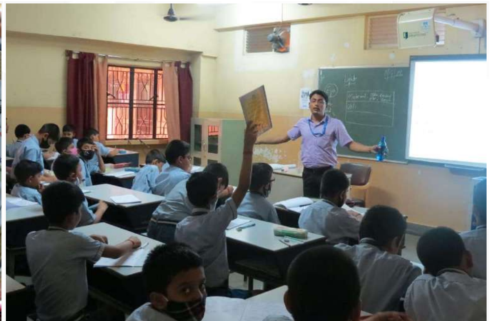
School Internship Programme