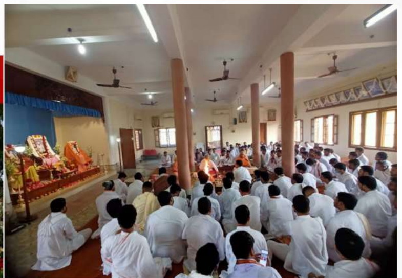
Hostel Prayer Hall