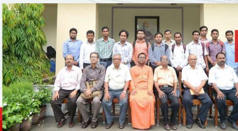
First M.Phil Batch