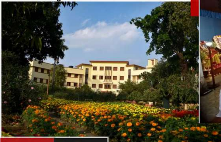
Hostel Building & Garden