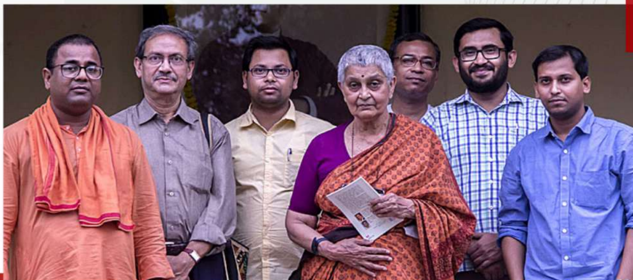
Gayatri Chakravorty Spivak with the Faculties

Sikshanamandira boasts a rich pool of eminent faculties of every discipline. Our faculties play an active role in conducting multifaceted researches in the field of Educational Studies both independently and under the umbrella of SWAMI VIVEKANANDA CENTRE FOR MULTIDISCIPLINARY RESEARCH IN EDUCATIONAL STUDIES - the apex research wing of Sikshanamandira. The availability of such collective teaching and research experience, makes sure that the transfer of knowledge to the students becomes fruitful and ineffaceable.