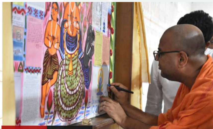
Inauguration of Wall Magazine