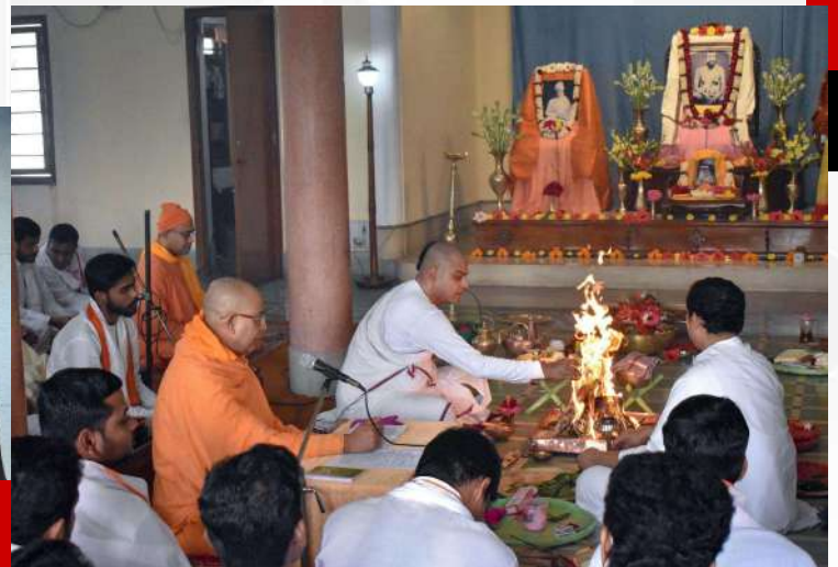
Vidyarthi Brata Homa