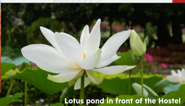
Lotus pond in front of the Hostel