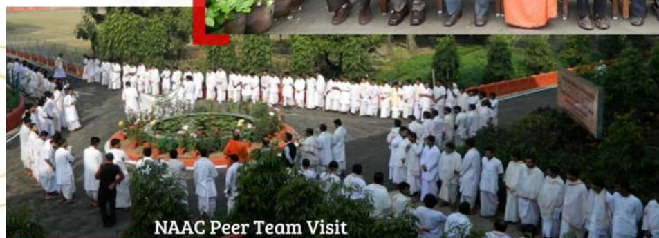
NAAC Peer Team Visit