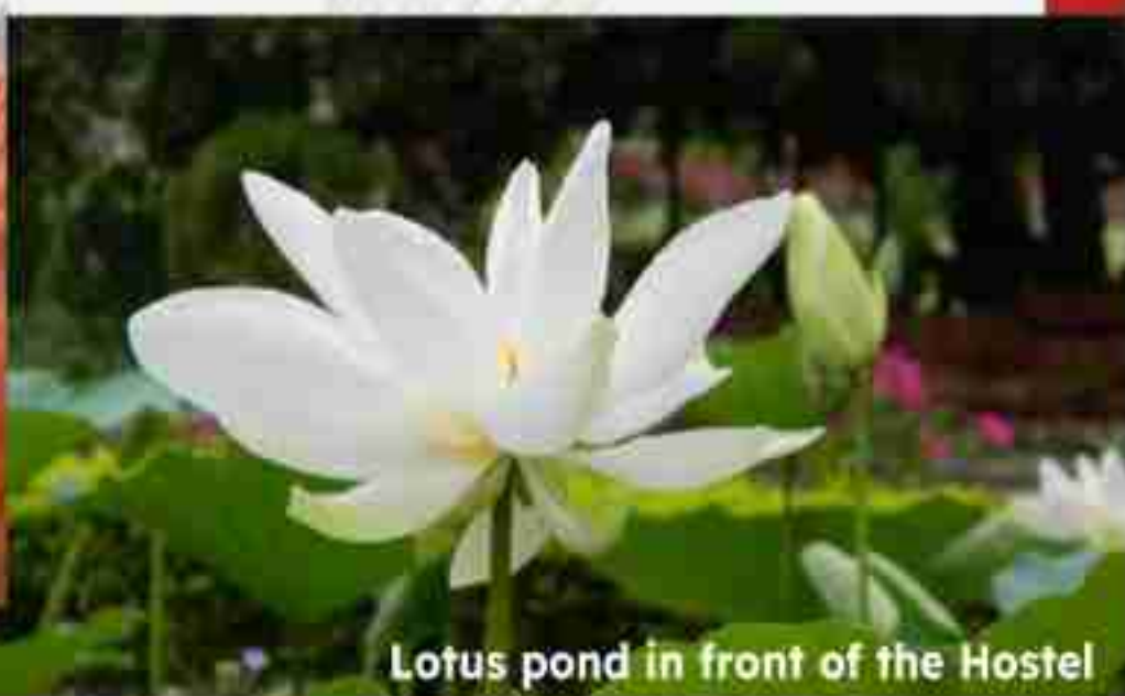
Lotus pond in front of the Hostel