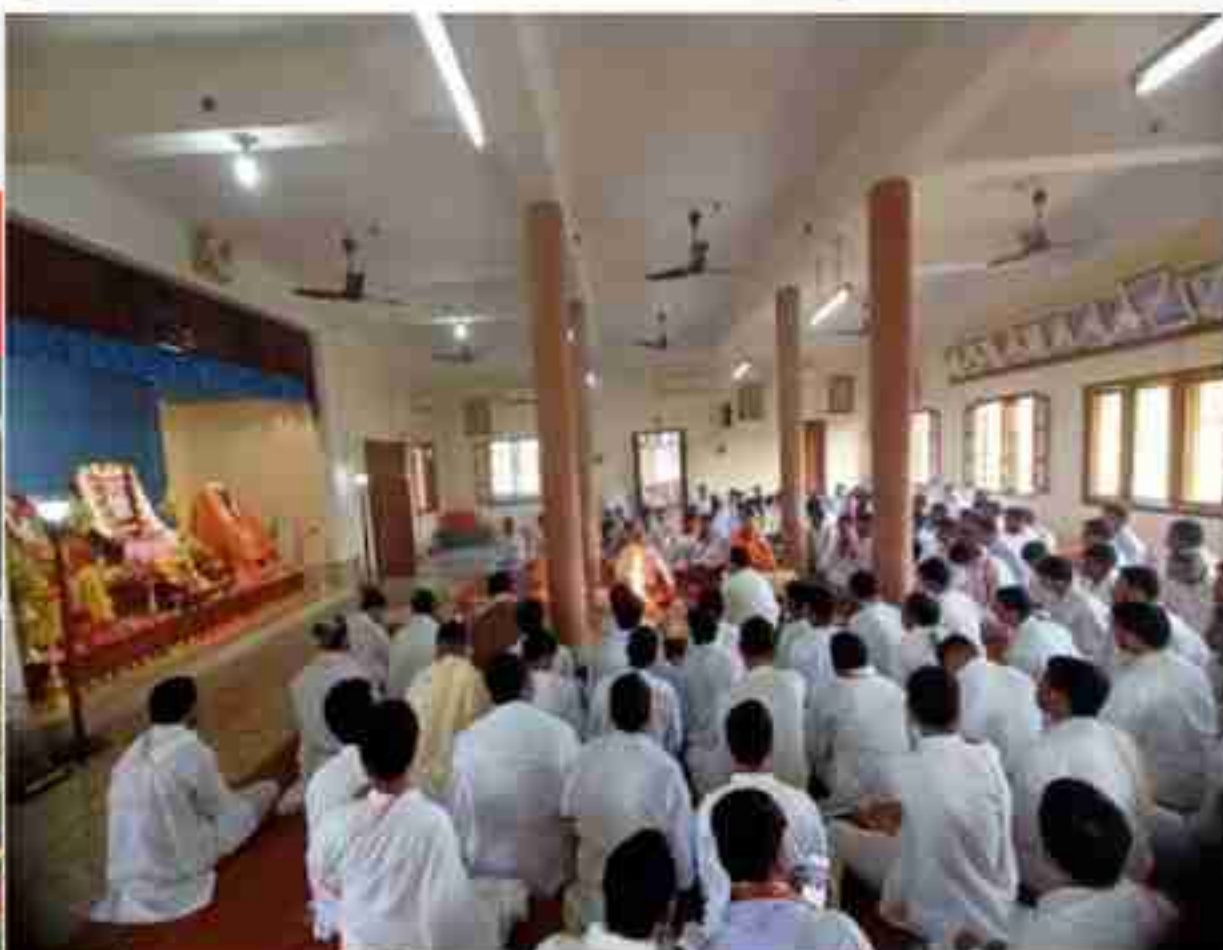
Hostel Prayer Hall