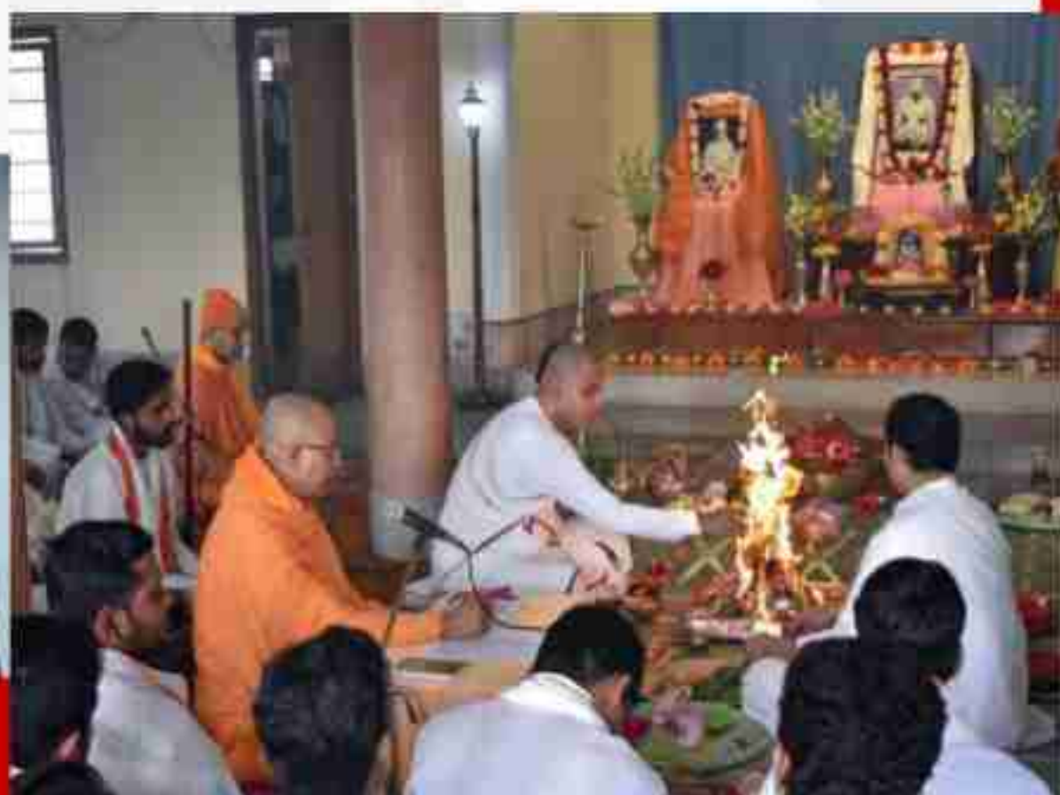
Vidyarthi Brata Homa