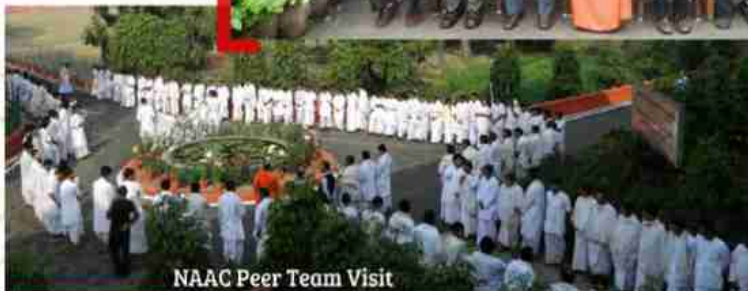
NAAC Peer Team Visit