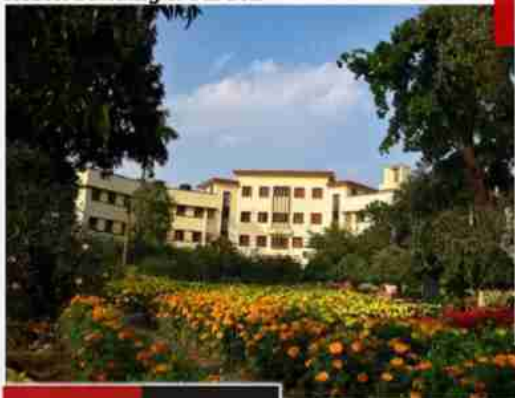
Hostel Building & Garden