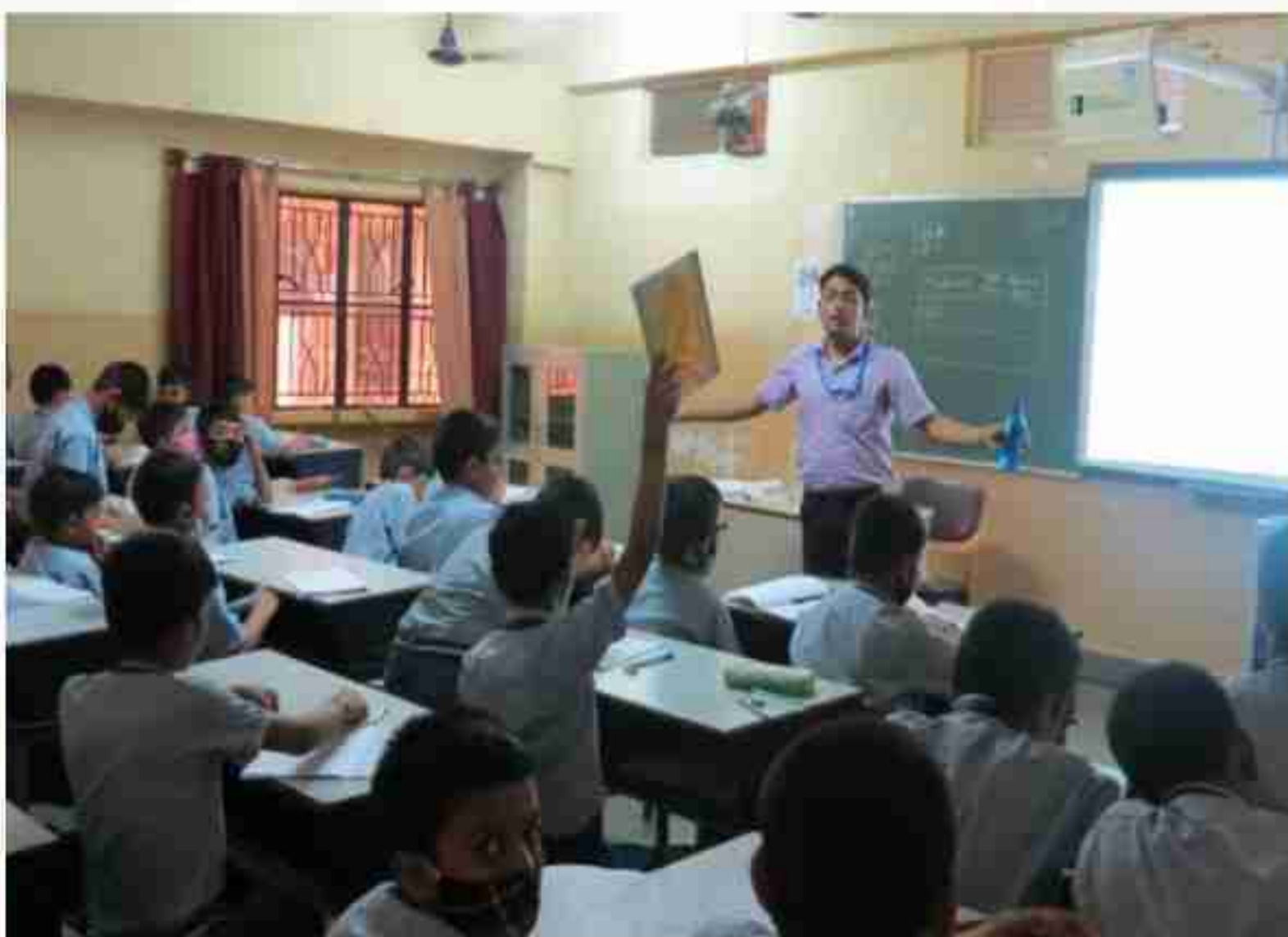
School Internship Programme