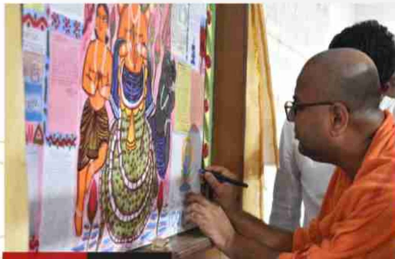
Inauguration of Wall Magazine