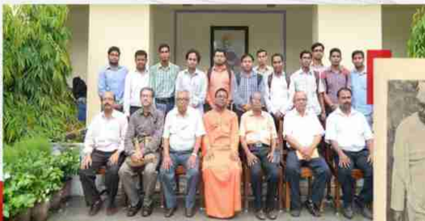
First M.Phil Batch