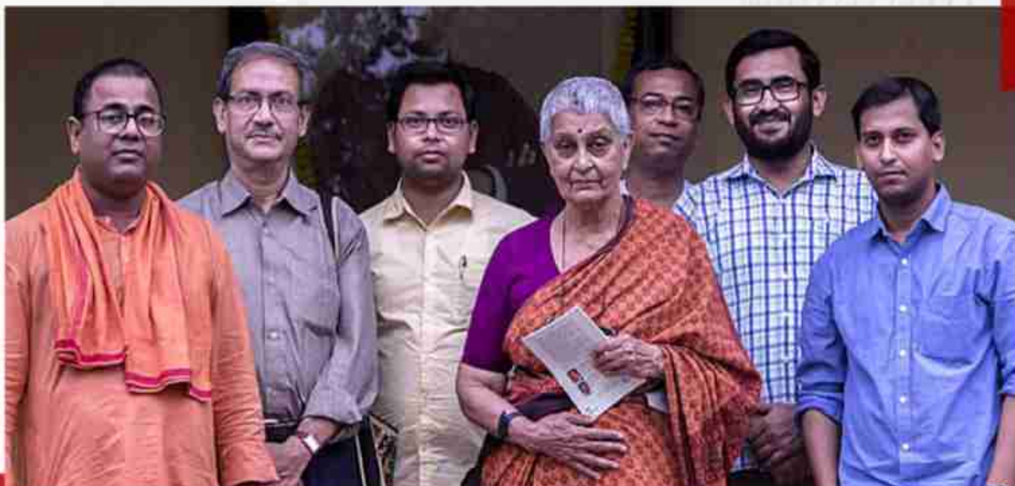
Gayatri Chakravorty Spivak with the Faculties

Sikshanamandira boasts a rich pool of eminent faculties of every discipline. Our faculties play an active role in conducting multifaceted researches in the field of Educational Studies both independently and under the umbrella of SWAMI VIVEKANANDA CENTRE FOR MULTIDISCIPLINARY RESEARCH IN EDUCATIONAL STUDIES - the apex research wing of Sikshanamandira. The availability of such collective teaching and research experience, makes sure that the transfer of knowledge to the students becomes fruitful and ineffaceable.