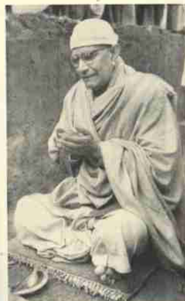
শ্রী ১০৮ জনগণের (কল্যাণের) উদ্দেশ্যে ব্রহ্মচর্য করেছেন (১৯৪৫-১৯৪৬ খ্রিঃ)